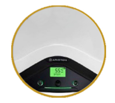
Hot water system powered with aerothermia NUOS 110 Ariston